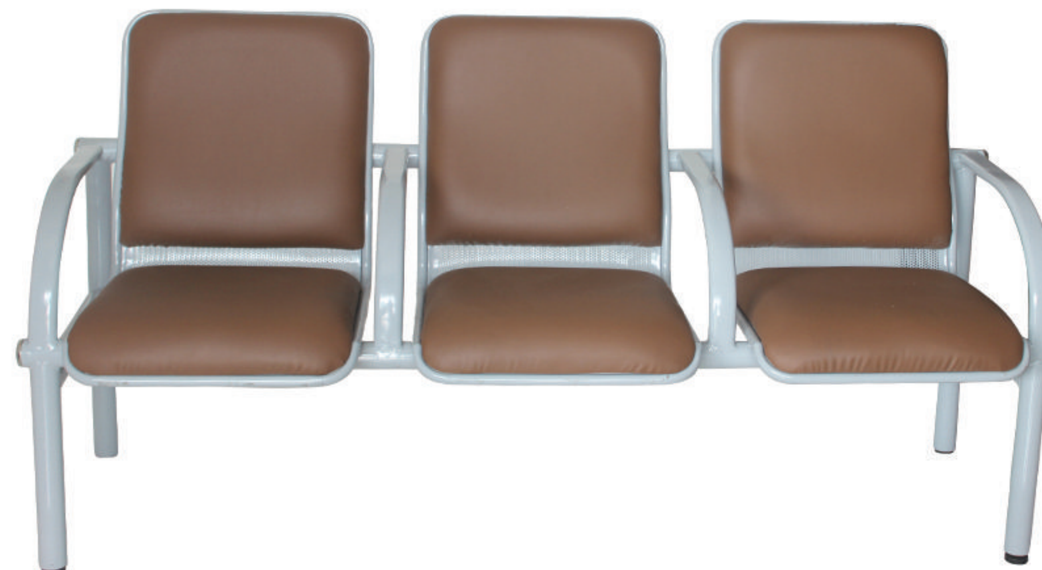
BOARDING 3S- C